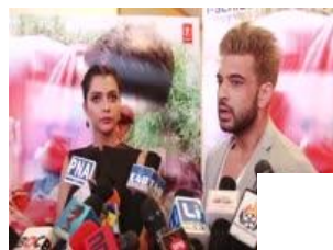
Karan Kundra and Ruhi Singh sizzling chemistry in... Entertainment 1:30