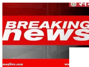
'India is not intolerant country'-Taslima Nasreen News 2:17