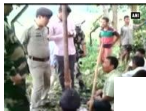
Over 150 Bangladeshi minority families take refu... News 0:32