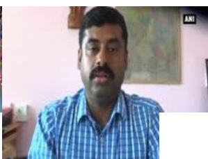
24 Bangladeshis arrested for trespassing into Tripura News 0:41