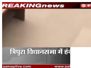
Live Video: TMC MLA snatched fled Mike of... News 1:04